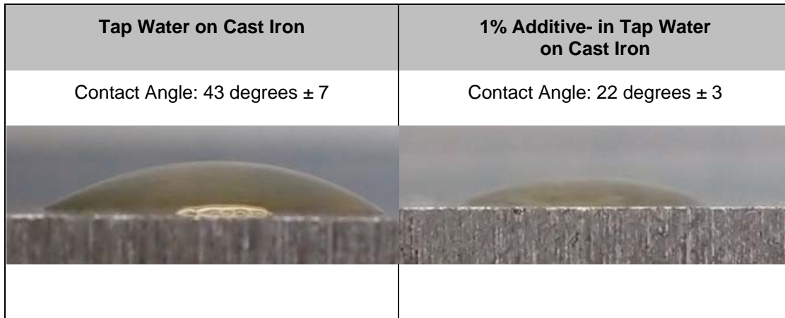
Table 3. Contact Angle Test Results